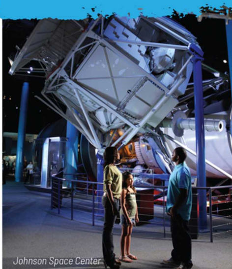
Johnson Space Center